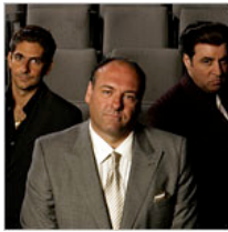
After 'Sopranos,' a Need for a Hit