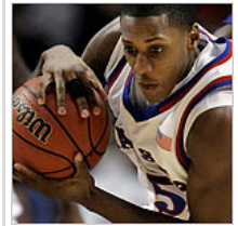
Out of Bounds: A Rooters' Guide

Home | World | U.S. | N.Y. / Region | Business | Technology | Science | Health | Sports | Opinion | Arts | Style | Travel | Jobs | Real Estate | Automobiles | Back to Top