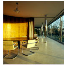
A Mies Masterwork, Deteriorating