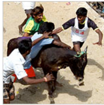
Ring in the New Year by Wrestling Bulls