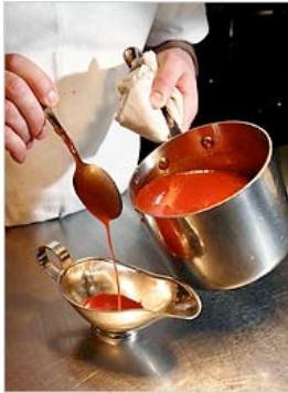
Red sauce made of Redbull and Starburst candy.

A uniformed waiter entered the kitchen, picked up a tray of martini glasses filled with irregularly shaped brown objects, studied it closely, and asked, "Chef, what is this I'm sending out?"